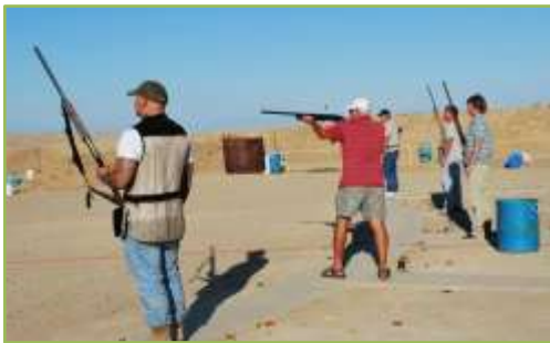
Trap shooters stepping up to the line to shoot at the weekly Trap Shoot.

In addition to the weekly trap shoots on Thursday's at 4:30 PM, we have monthly youth trap shoots on the third Sunday of the month at 1 PM.